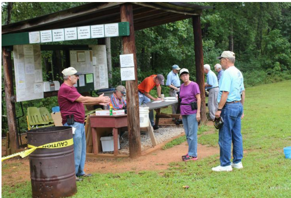
(Range shelter with displayed rules and procedures)

Item 57: Sponsored, staffed and conducted an 'Amateur Handgun Competition' for members, guests and the public in the spring and fall of 2014. Awarded monetary prizes and certificates to the top finishers.