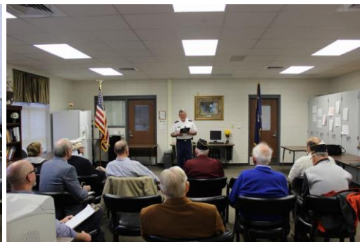
(Judges and audience)