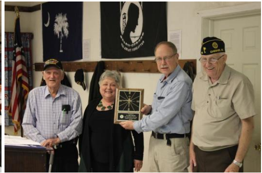
(The line-up for food and presentation of the Post 48 Legionnaire of the year award)