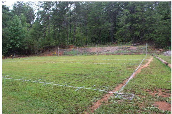
(New Gong Targets and barrier; fencing for normal paper targets)