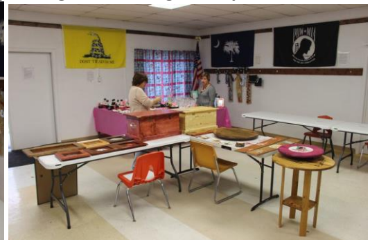
(Auxiliary Unit 48 Craft Show)