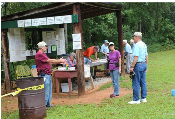
(Range shelter with displayed rules and procedures)

Item 57: Sponsored, staffed with volunteers and conducted an 'Amateur Handgun Competition' for members, guests and the public in the spring and fall of 2015. Awarded monetary prizes and certificates to the top finishers.