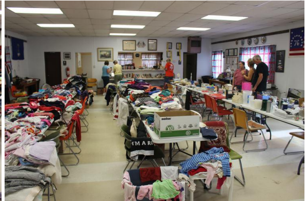
(Yard Sales in the Spring and Fall)

Item 56: Maintained a public Small Arms Range for use by members, guests and the public at large. Facilities include distance markers, assembly shelter, parking area and wire fencing for target mounting. In 2015, Post 48 expanded the range to include an area set aside for 22 caliber rim fire.