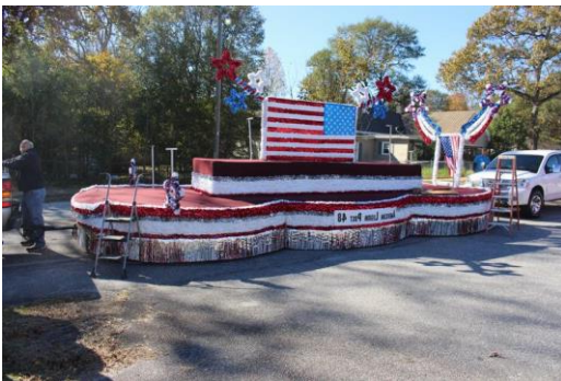
(Post 48 Parade Float)